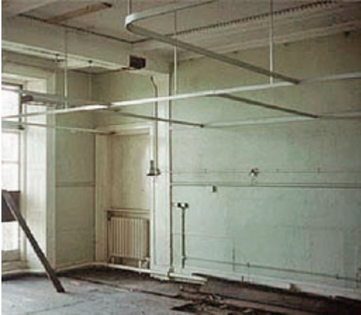
THE NEWLY RESTORED NORTH FACADE OF MOGGERHANGED, ABOVE, AND THE EATING ROOM, BELOW, AS IT APPEARED BEFORE AND AFTER WORK WAS COMPLETED THIS SPRING.