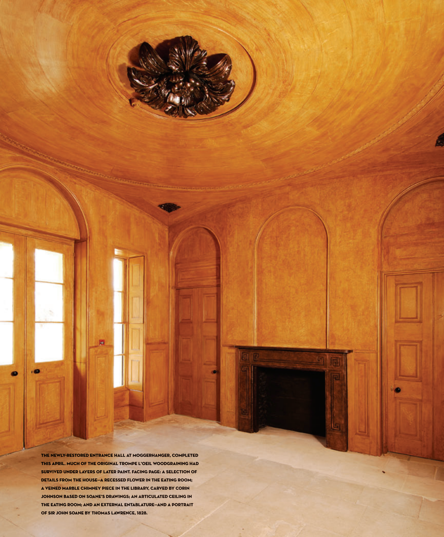
THE NEWLY-RESTORED ENTRANCE HALL AT MOGGERHANGER, COMPLETED THIS APRIL. MUCH OF THE ORIGINAL TROMPE L'OEIL WOODGRAINING HAD SURVIVED UNDER LAYERS OF LATER PAINT. FACING PAGE: A SELECTION OF DETAILS FROM THE HOUSE—A RECESSED FLOWER IN THE EATING ROOM; A VEINED MARBLE CHIMNEY PIECE IN THE LIBRARY, CARVED BY CORIN JOHNSON BASED ON SOANE'S DRAWINGS; AN ARTICULATED CEILING IN THE EATING ROOM; AND AN EXTERNAL ENTABLATURE—AND A PORTRAIT OF SIR JOHN SOANE BY THOMAS LAWRENCE, 1828.