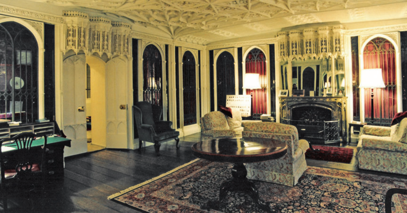
THE LIBRARY AT STOWE, SOANE'S ONLY MAJOR ATTEMPT AT THE GOTHIC IDIOM, LIES BURIED IN THE CENTER OF THE HOUSE ON THE GROUND FLOOR

of Soane's mind. Exquisitely tooled rooms lead off each other, with windows arranged in matching patterns. Archways and doors play bat and ball, and an extraordinary floating staircase levitates upwards, decorated only by the thinnest swan-necked balusters stacked like black eyelashes.