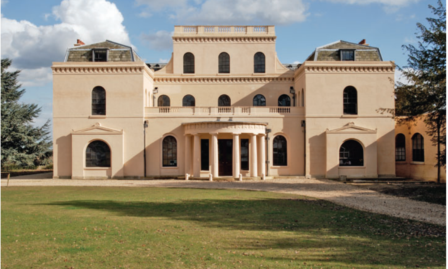
PHOTO BY RICHARD HOLLTUM PORTRAIT COURTESY SIR JOHN SOANES MUSEUM, LONDON